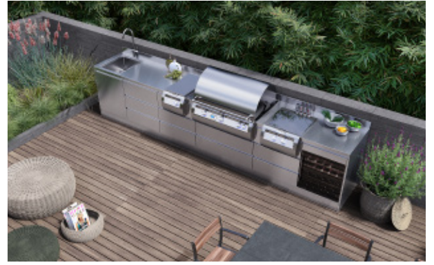
Stainless steel kitchen